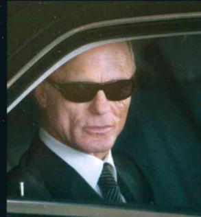
History of Violence / Dějiny násilí, 2005