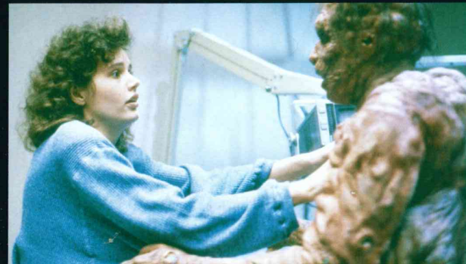
The Fly / Moucha, 1986

21 features / 21 celovečerních filmů 1969-2014