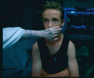
Maps to the Stars / Mapy ke hvězdám, 2014